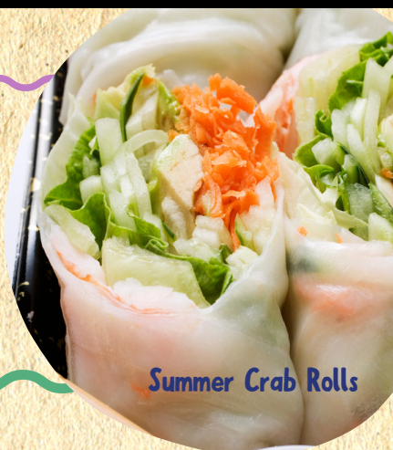
Summer Crab Rolls

Delicious & fresh with raw mangoes, papayas and homemade peanut dressing