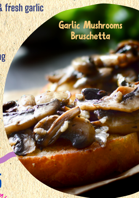
Garlic Mushrooms Bruschetta